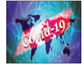
COVID updates See Page 8