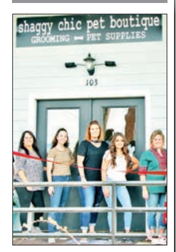
Shaggy Chic open for pet cuts