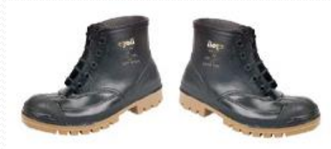
Safety Footwear (no flip flops)